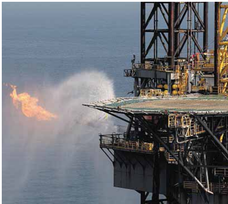
FIND: Parkmead is one of four partners in the Drenthe IIIb licence

Parkmead has gone from having no oil and gas assets at all in November 2011 to a growing presence in the